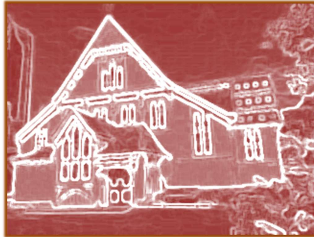
St Mary's-in-Holy Trinity